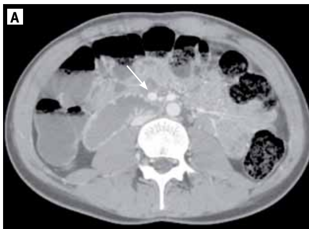
[A] CT scan showing a distended proximal duodenum containing liquid contents. External pressure on the duodenum by blood vessels is demonstrated (white arrow)

Laboratory results did not show abnormal findings. A test for the presence of Helicobacter pylori in the stomach and a stool culture were negative. There were no gross pathological findings on gastroscopy and no significant mucosal changes on small intestinal biopsy. Abdominal computed tomography scan demonstrated an angle of 16° between the abdominal aorta and the origin of the superior mesenteric artery. The distance measured between these vessels was 4.5 mm. CT scan also demonstrated a slight expansion of the stomach and proximal duodenum [Figure A], as well as narrowing of the duodenum lumen between