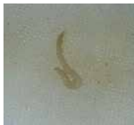
Figure 1. The “worm”

The interesting point in this case is that the patient took a picture of the Ascaris with her own smartphone and brought it