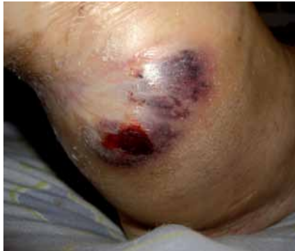
Figure 2. A superficial ulcer at the periphery of a purplish edematous plaque on the right posterior calf of patient 3

clinically compatible with PG [Figure 2], accompanied by erythematous indurated and tender plaques on her upper and lower extremities suggestive of EN. She also complained of recrudescence of bloody stools and abdominal pain. She was treated with intravenous hydrocortisone 100 mg tid which led to amelioration of all intestinal and dermatological complaints. The intravenous steroid treatment was changed to prednisone 60 mg, which was tapered down with gradual resolution of the PG as well as fading of the EN lesions. The patient denied skin biopsies as both skin manifestations were well known to her and had been biopsied in the past.