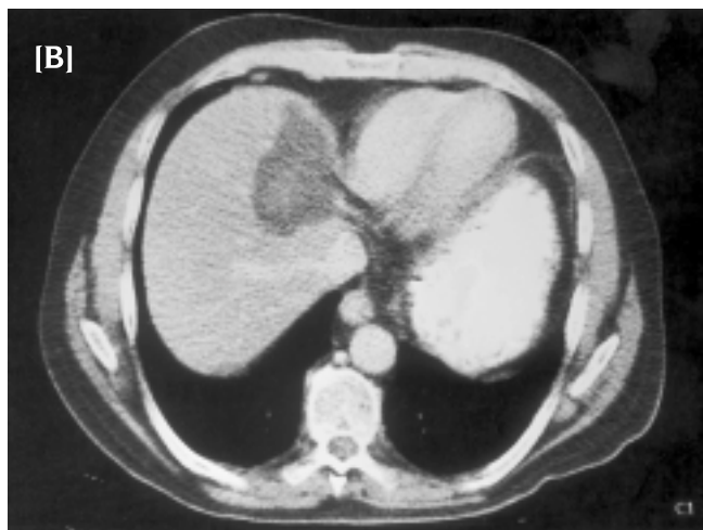
Figure 2. A 56 year old patient after left hepatic lobectomy for liver metastases. [A] Arterial phase CT scan obtained before RFA demonstrated a 7 cm hyperattenuating mass in segment 8 consistent with recurrence. [B] CT obtained 2 months after intraoperative RFA revealed complete ablation without recurrence.