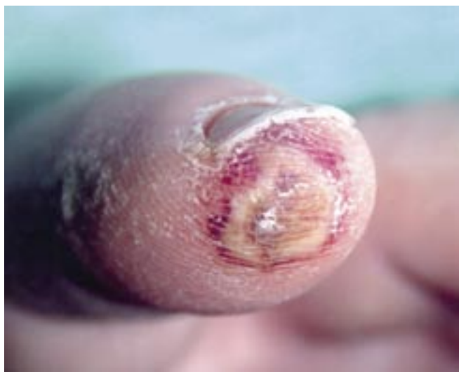
[A]. Central area of skin and underlying tissue necrosis with surrounding ischemic skin