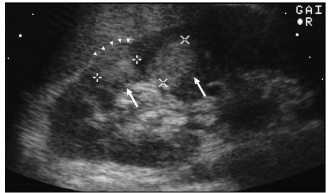
Figure 3. Transverse scan of the right kidney in a 33 year old female. A wedge-shaped area of increased echogenicity (arrows) is identified in the middle part of the kidney. The lesion presents no defined borders and complete blurring of the CMJ.