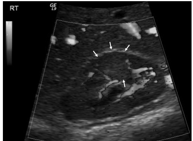
Figure 4. Power Doppler examination of the right kidney in a 27 year old female shows an area of decreased blood flow in the region of the hyperechoic lesion (arrows).

to the adjacent renal parenchyma. All these lesions appeared quite homogeneous in echogenicity, without the presence of a capsule. Twenty-six of these hyperechoic focal areas were in the right kidney and 19 in the left. In one patient a hyperechoic area was seen in each kidney, and in another patient two masses were identified in the same kidney [Figure 2]. Twenty-seven hyperechoic areas were located in the upper pole or in its proximity. The contours of all these lesions were not well defined. The size of the hyperechoic areas ranged from 1.6 to 4 cm. The CMJ appeared blurred in the majority of cases. The lesions were wedge-shaped in 34 patients [Figure 3] and appeared as an irregular mass in 13 [Figure 2]. In five cases, a small amount of perirenal fluid was also seen. Color/power Doppler examination was performed in 38 of the 47 cases. The focal area appeared avascular or hypovascular in all cases [Figure 4], with no hypervascularity seen in their periphery.