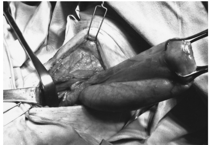
[A] Large exposed diverticular sac

An open procedure was performed via a transcervical excision, and the sac, found to contain contrast media and other remains, was excised and a nasogastric tube introduced [Figure A]. Due to esophageal friability, hand suturing was applied. Following the procedure a small fistula developed but spontaneously healed after 6 days and oral intake was resumed one week later. Today, 3 months