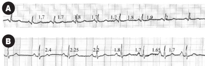
Figure 1. [A] Sample ECG recording of a patient with a low HRV. ECG was measured at paper speed of 25 mm/sec. The shortest and longest beat-to-beat interval was 1.7 and 2.0 sec respectively, 150/1.7 = 88 , 150/2.0 = 75 . The difference is 13 beats/min, hence the HRV of 13. [B] Sample ECG recording of a patient with a high HRV. ECG was measured at paper speed of 25 mm/sec. The shortest and longest beat-to-beat interval was 1.65 and 2.4 sec respectively, 150/1.65 = 90 , 150/2.4 = 62 . The difference is 28 beats/min, hence the HRV of 28.

Center Institutional Review Board and each patient signed an informed consent.