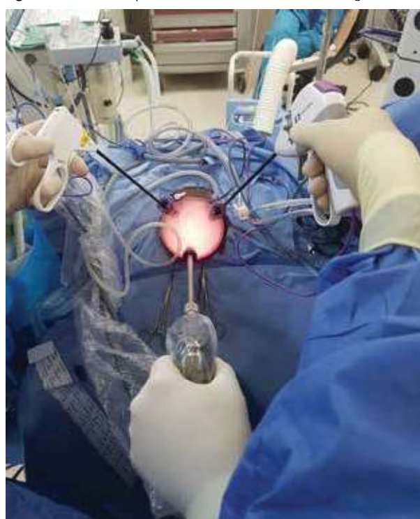
Figure 1. vNOTES GELpoint and instrument insertion through trocars