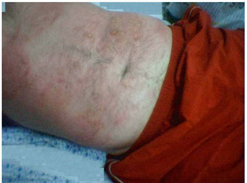
Patches of erythema, with clear vesicles and bullae on the abdomen

A literature survey revealed a wide spectrum of reactions. These include a relatively self-limited reaction of oral allergy syndrome [1], and photocontact dermatitis as an acute skin reaction that may be easily confused with other causes of contact dermatitis and is termed phytophotodermatitis. It is characterized by sunburn, blis-