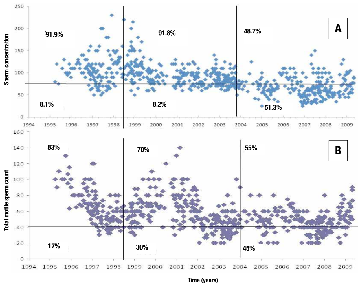
Figure 1. Distribution of the monthly mean sperm count [A] and mean total motile sperm count [B] of 696 specimens donated during the years 1995–2009.

mixed semen were placed in the chamber and spermatozoa were counted with a Zeiss microscope with phase optics at a magnification of x100 and x200. The percentage of progressive motile spermatozoa was calculated from the ratio of the number of rapidly moving sperm to the total number of sperm counted, according to the 1993 classification system of the World Health Organization [13]. Morphology score was not used as a parameter due to high inter-observer variation [14]. During the study period, all sperm analyses were performed in the same laboratory with the same equipment and by the same laboratory personnel. Tests of laboratory quality assurance were done periodically to ensure the validity of sperm analyses over time.