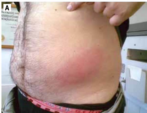
[A] An erythematous, warm, tender, localized rash, which appeared during some of the attacks. Note that the patient is pointing to the site where the rash originally appeared several days earlier.

A patient suffering from a periodic fever syndrome, characterized by attacks of fever, severe abdominal pain, a migratory ery-