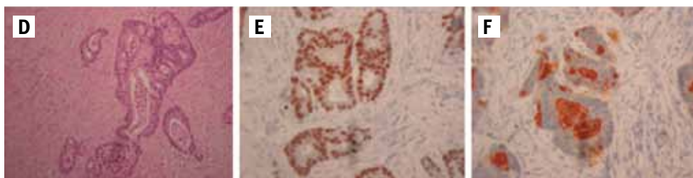
[D] Well-differentiated adenocarcinoma, composed of well-defined malignant glands (hematoxylin & eosin, original magnification x 200). The neoplastic epithelial cells are immunoreactive for the colonic markers CDx2 [E] and CEA [F] (original magnification x 400)

lithotripsy, and posterior urethral valve. Congenital cases also exist. It has been suggested that urinorhox can be either obstructive, following bilateral urinary tract obstruction, or traumatic, which is usually unilateral [1]. Unilateral ligation of the ureter in dogs failed to produce urinorhox. A recently published case described a unilateral urinoma secondary to obstruction from nephrolithiasis in a patient with multiple metastases. Although the obstruction resulted in a large abdominal bulging mass, it did not evolve to urinorhox [3]. Comprehensive review of the literature