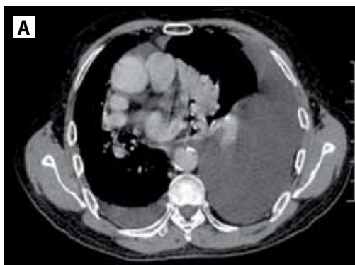
[A] Axial CT image of the patient's chest showing a large left pleural effusion displacing the mediastinum to the right