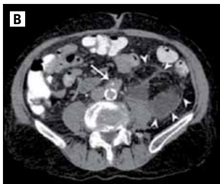
[B] Axial CT image of the patient's abdomen, showing a retroperitoneal mass (arrow) and fluid collection around the left kidney (arrowheads)