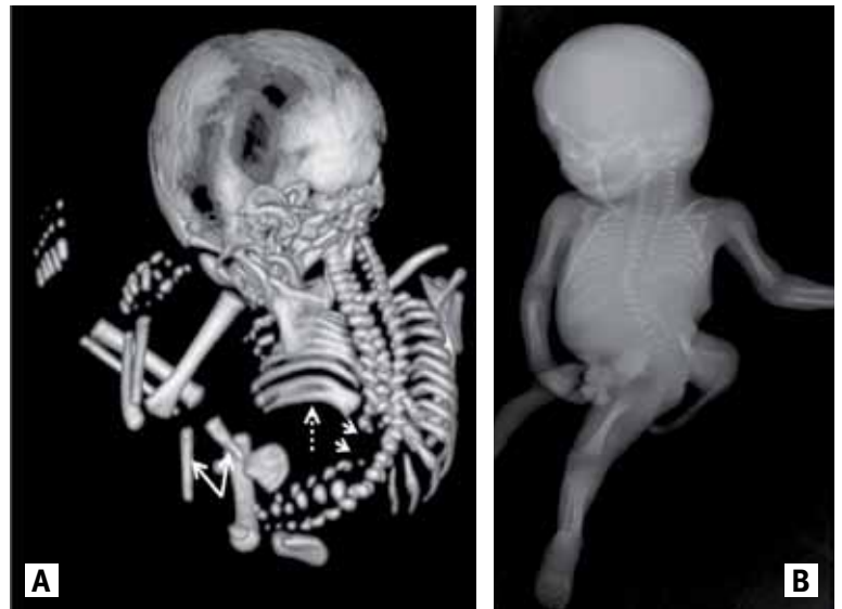
Figure 3. [A] Prenatal 3D-CT at gestational week 17 in a 29 year old woman (case 4, Table 1) demonstrates scoliosis, D9–L2 hemivertebra (arrowheads), rib fusion on the left hemithorax (dashed arrow), and short hypoplastic bones in the left lower limb (solid arrows). The diagnosis of proximal focal femur dysplasia was confirmed genetically [B] X-ray of the fetus taken after birth showing the same findings

more accurate. CT is less vulnerable to image degradation by maternal body habitus, and obviates problems of acoustic shadowing seen on ultrasound. With CT, only ossified bone can be demonstrated, while on ultrasound both ossified and chondral non-ossified bone is included in measurements. Therefore, the use of standard ultrasound percentile charts for CT-based measurements is questionable. However, since CT examinations during pregnancy are relatively rare, CT-dedicated growth charts are not likely to be created in the near future.