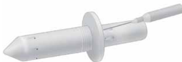
Figure 1. Intraluminal assist device used for symmetric intramural sclerosant injection

Committee and the local Institutional Review Board [14]. Seven female pigs of domestic breed (large white X Landrace, Sus scrofa domestica ) were obtained from the Lahav Research Institute (LRI) with a mean body weight of 28 \pm 4 kg. Animals were fed a daily balanced swine diet, except on the day of surgery, with free water access at all times. Several synchronous experimental protocols were used to assess the safety, efficacy, concentration and dosage of two different compounds and to define the optimal administration regime [Table 1].