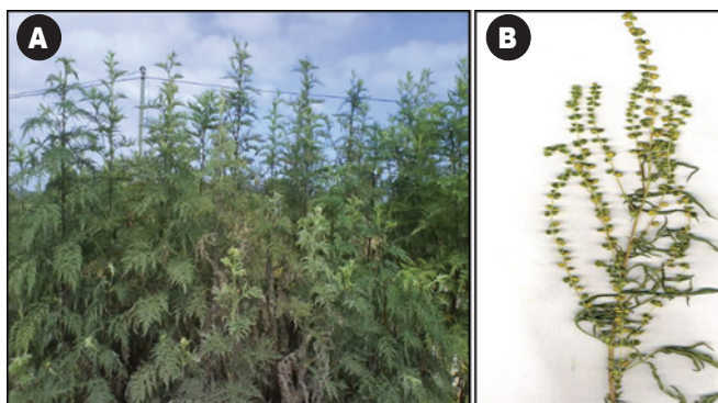
Figure 1. [A] A stand of Ambrosia. [B] A flowering branch of Ambrosia confertifolia

three percent of the patients who were sensitized to Ambrosia responded to the pollen extracts of all three species. This irrefutably indicates the similarity of the allergens of the pollen of the different species. However, apart from the common allergens of all three species, some specific allergens seem to exist in the pollen of the local Ambrosia plants and these are identified by local patients.